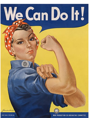
Rosie the Riveter was the embodiment of the can-do spirit of civilian women in WWII. Used as a figure to encourage women to join the industrial workforce, Rosie has become an iconic female figure.