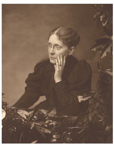
Suffragist and temperance advocate, Frances Willard was a tireless worker for causes which impacted women. She was the first female depicted in the Statuary Hall in the United States Capitol.