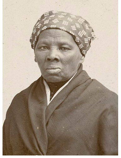
Harriet Tubman embraced the causes of abolition and women's suffrage. When asked if she believed women should vote she famously replied, "I suffered enough to believe it."