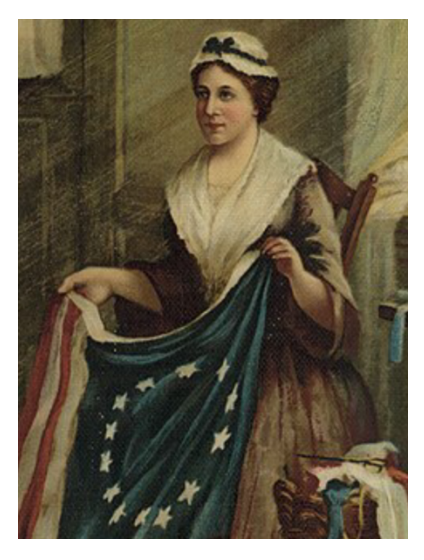
Betsy Ross was the alleged designer of the second American Flag, known as the Betsy Ross Flag. Despite no documentary evidence to substantiate this claim, Ms. Ross has become a powerful symbol of the role played by women in the Revolutionary War and early days of the Republic.