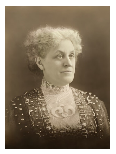
Carrie Chapman Catt was a key figure in the women's suffrage movement in the USA which provided the impetus in winning the right to vote for women.