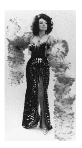
Blaze Starr (Fanny Belle Fleming) was a burlesque performer of national renown. At a time when many viewed burlesque as lowbrow entertainment, she remained loyal to it's more anarchic nature, poking fun at highbrow dramatic conceits.